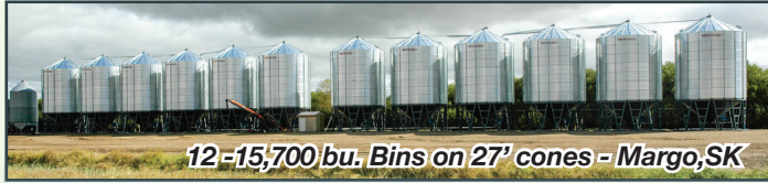
12-15,700 bu. Bins on 27' cones - Margo, SK