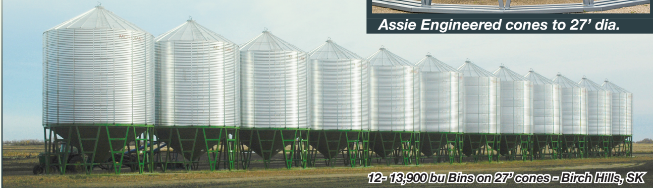
12-13,900 bu Bins on 27' cones - Birch Hills, SK