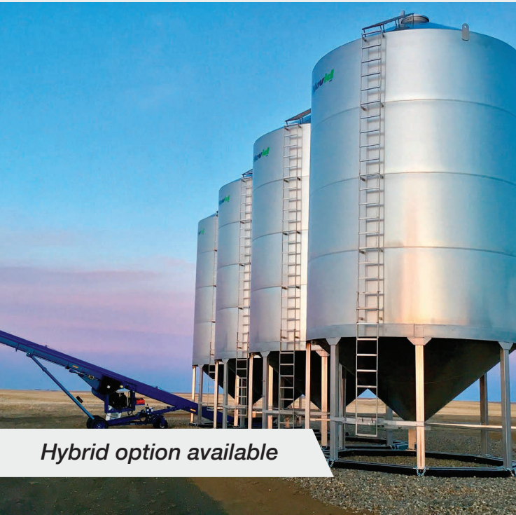
Hybrid option available