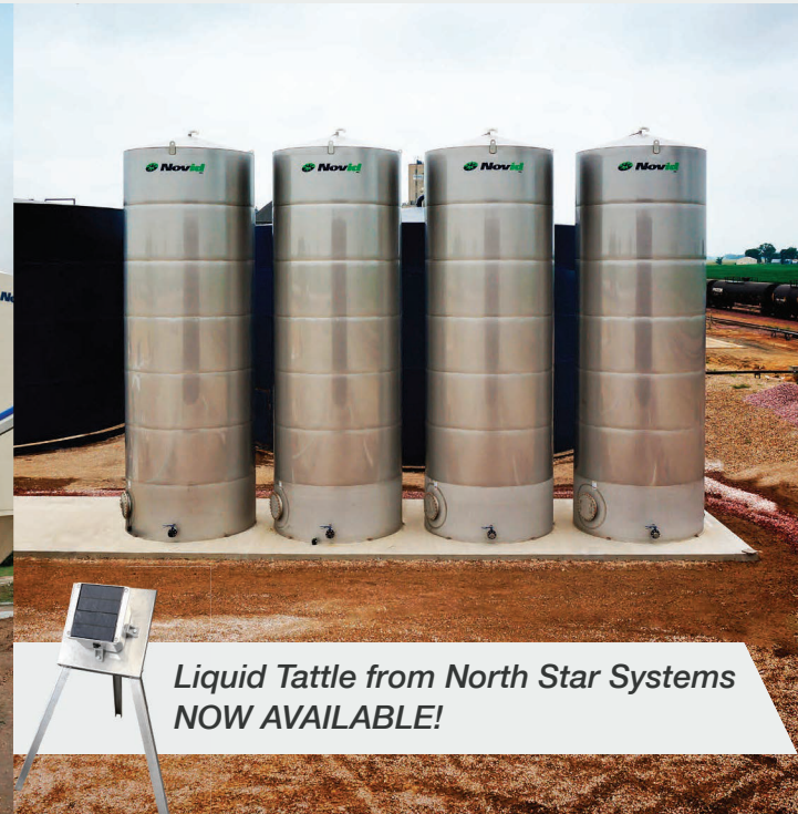
Liquid Tattle from North Star Systems NOW AVAILABLE!