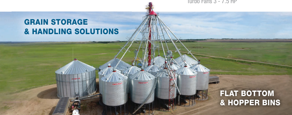
FLAT BOTTOM & HOPPER BINS