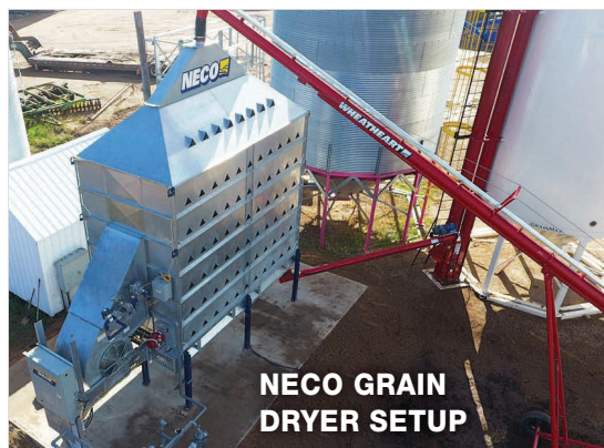
NECO GRAIN DRYER SETUP

NISKU, AB 888.850.9579 MEDICINE HAT, AB 888.683.9503 PRINCE ALBERT, SK 866.730.5271 YORKTON, SK 888.343.3842 SWAN RIVER, MB 888.631.0390 LETHBRIDGE, AB 587.813.6299 SASKATOON, SK 888.381.9697 SOUTHEY, SK 888.732.6187 MOOSOMIN, SK 888.329.2441