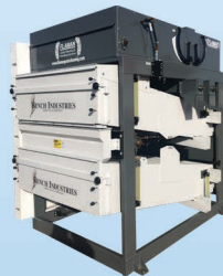
Bench Double Shoe High Capacity Air/Screen Cleaners