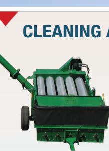
Kwik Kleen Models 572 or 772

Aluminium or Wood Frames Ball Trays & Balls Hand Sieves