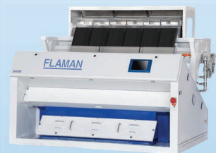
Satake RGB Full Colour & Shape Sorters 1 to 9 Chute Options