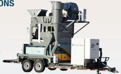
Bench Mobile Seed Cleaners