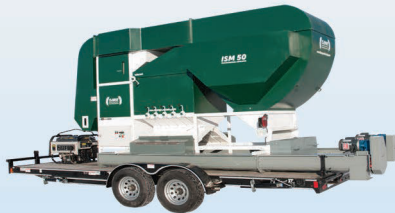
ISM Separator Fractionating Aspirator Mobile Unit Shown