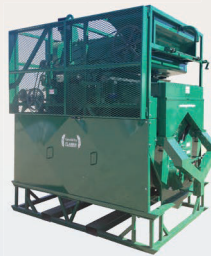
Gjesdal Seed Cleaners All in One