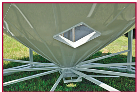
Manholes are standard equipment on all of our cones.

Manholes are standard equipment. Options include custom skids, ladders, anchors, remote lids and aeration. Check out the total package before you buy.