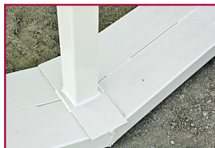
Optional skid base is 188 wall tubing available in single or double skid configuration.