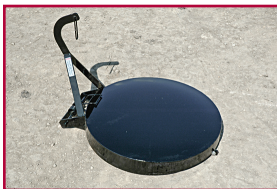
Various sizes of remote opener lids available.