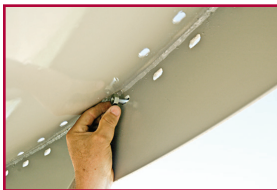
M&K hopper bottoms have the band facing down, rather than up. You don't have to go inside the cone to assemble your storage.