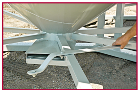
12" or 18" sliding gate.