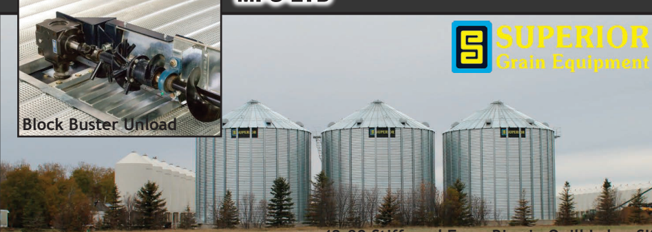
42-09 Stiffened Farm Bins in Quill Lake, SK